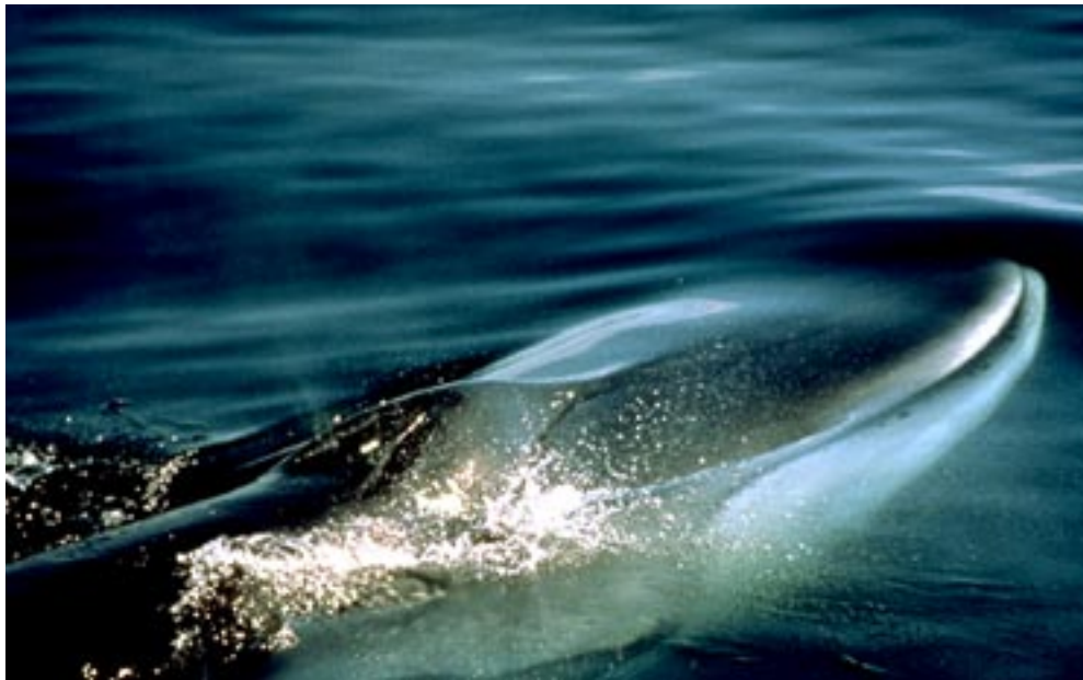
Finback whales and a myriad of aquatic species inhabit the island's ocean waters.

snowy egret, osprey, turkey vultures, red-tailed hawks, kestrels and great-horned owls. Its surrounding waters contain well-preserved coral reefs, resident colonies of sea lions, five species of marine turtles and a myriad of aquatic species characteristic of the Gulf of California's outstanding marine biodiversity.